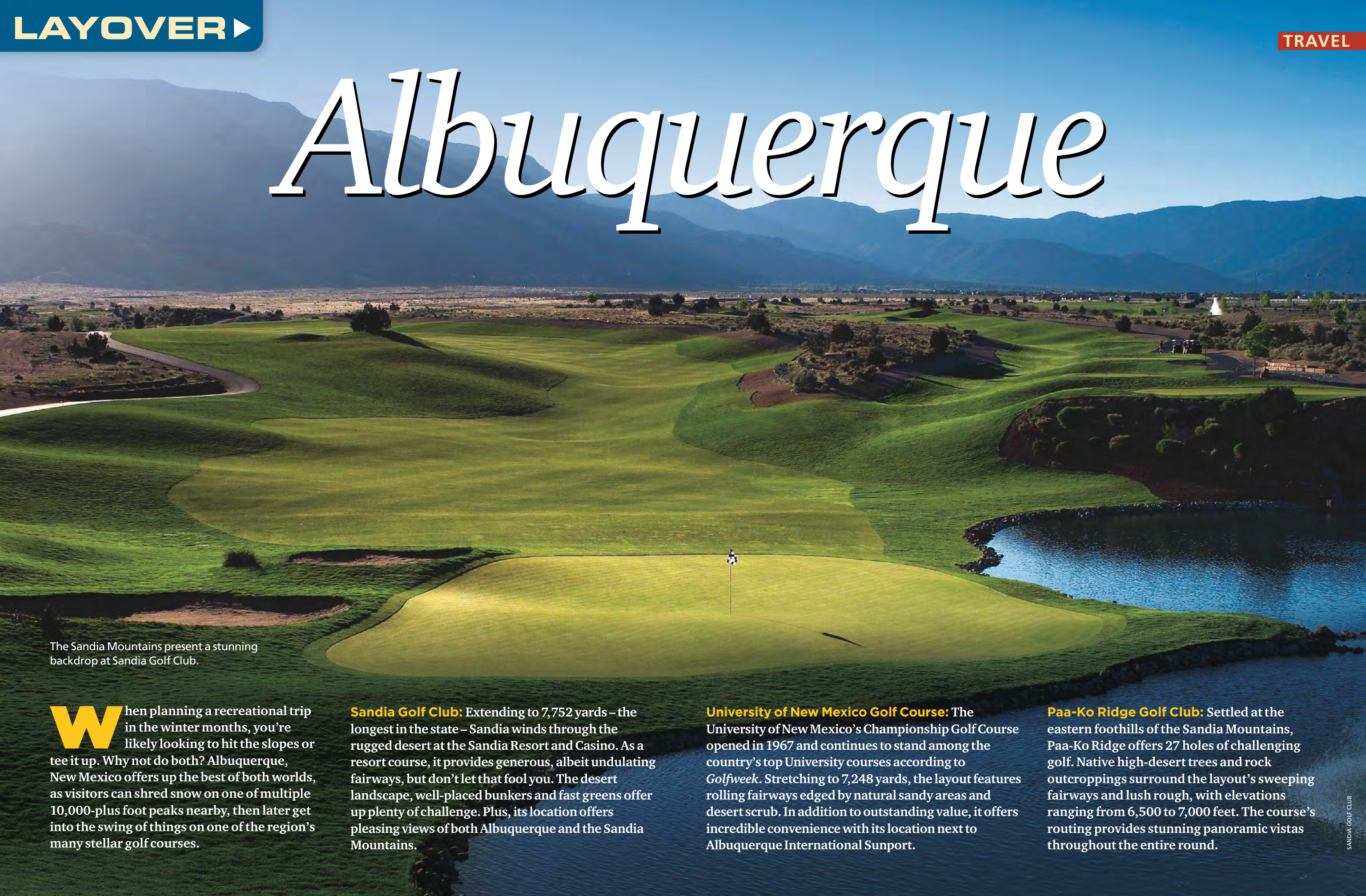
The Sandia Mountains present a stunning backdrop at Sandia Golf Club.

W hen planning a recreational trip in the winter months, you're likely looking to hit the slopes or tee it up. Why not do both? Albuquerque, New Mexico offers up the best of both worlds, as visitors can shred snow on one of multiple 10,000-plus foot peaks nearby, then later get into the swing of things on one of the region's many stellar golf courses.