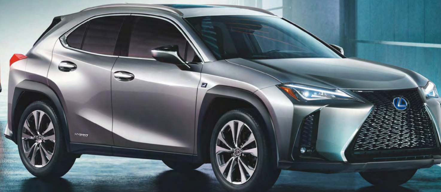
UX 250h F SPORT AWD 2