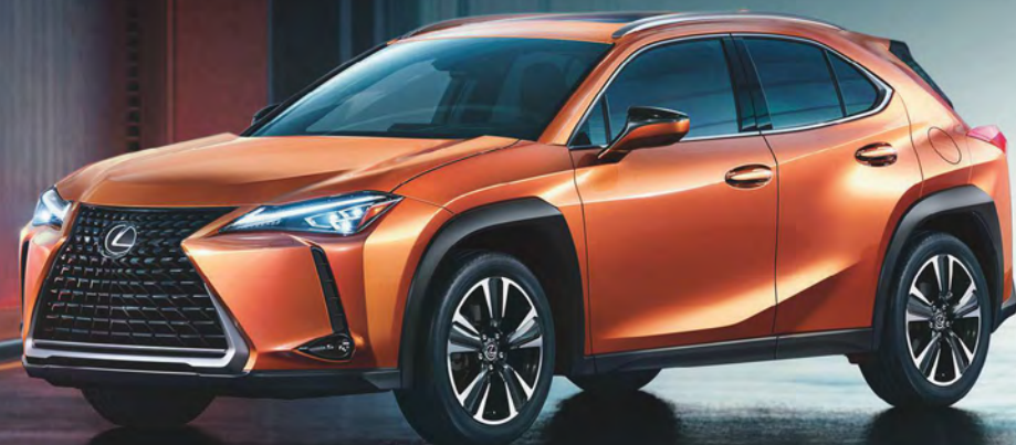
UX 200 1