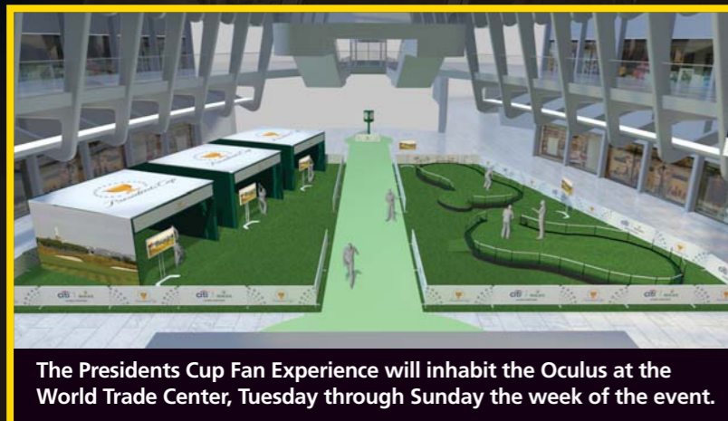
The Presidents Cup Fan Experience will inhabit the Oculus at the World Trade Center, Tuesday through Sunday the week of the event.