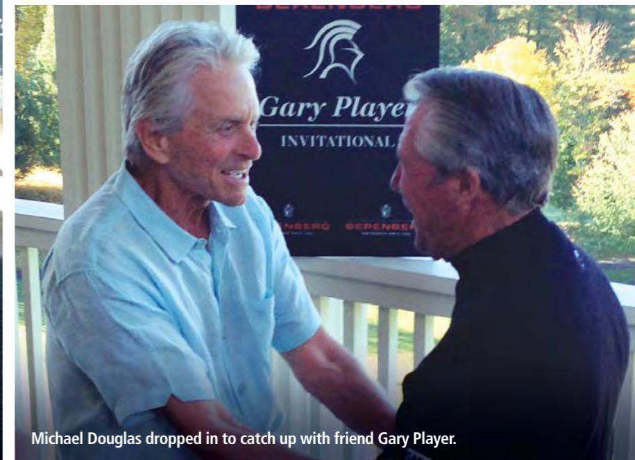
Michael Douglas dropped in to catch up with friend Gary Player.