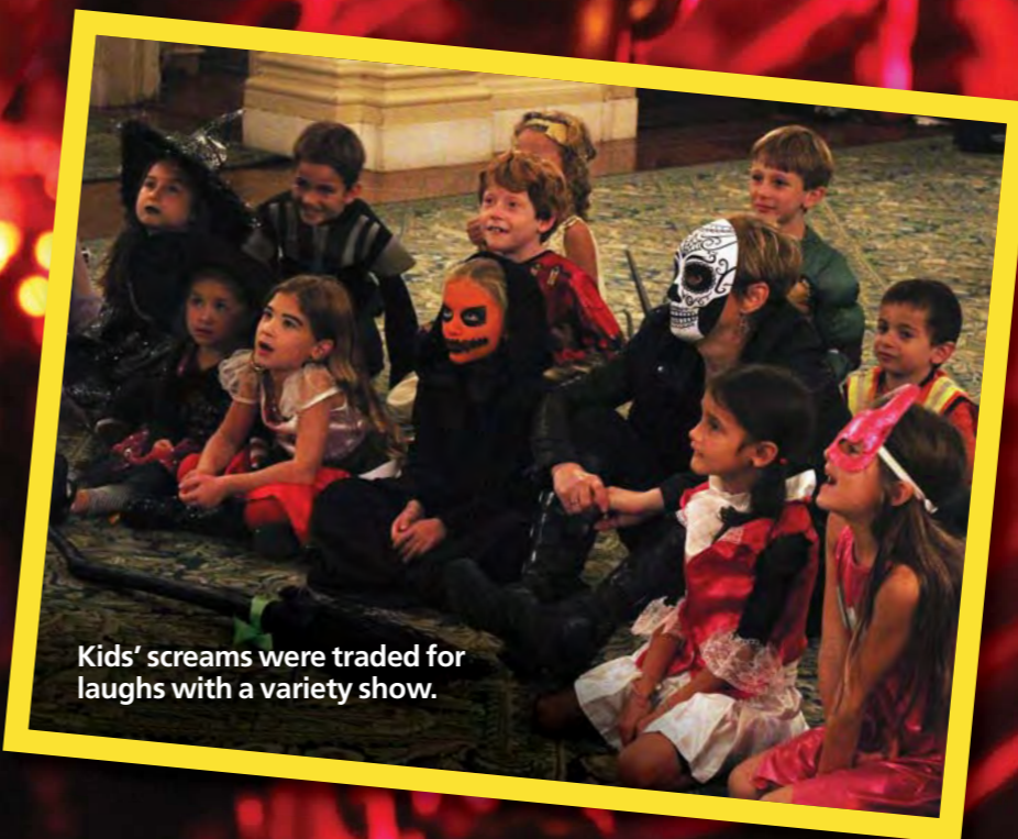
Kids' screams were traded for laughs with a variety show.

It wasn't all screams for attendees though, as a buffet dinner, face painting, costume contests and a variety show for kids and adults alike made it a fun-filled evening for all.