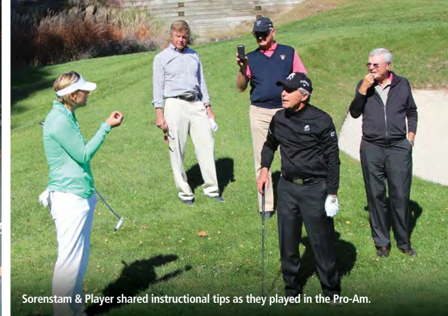
Sorenstam & Player shared instructional tips as they played in the Pro-Am.

Beginning in July in England, this year’s tournament series will continue with stops in China, South Africa and Abu Dhabi.