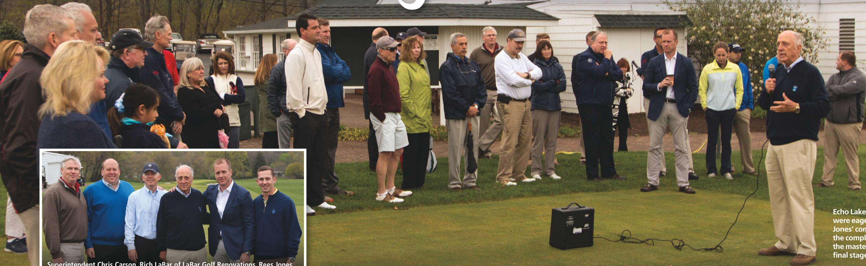
Echo Lake members were eager to hear Jones' comments on the completion of the master plan's final stage.