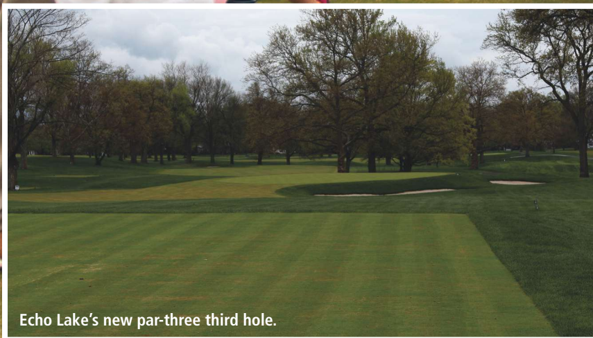
Echo Lake's new par-three third hole.

A fter embarking upon an ambitious golf course master plan in 2010, Echo Lake Country Club in Westfield, N.J., and its members will soon enjoy the finished project. Architect Rees Jones has overseen the master plan's completion, which has included substantial tree removal, rebuilding of greens, and the creation of new tee complexes.