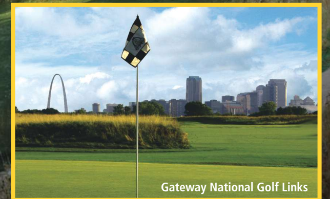
Gateway National Golf Links

Nearby: While these three courses circle the city, a convenient option just minutes from the airport is Normandie Golf Course, which leans on its history as the oldest public course west of the Mississippi. It features an old style of tree-lined fairways, rolling hills, blind shots, sharp doglegs and sloped greens—all defining elements of classic St. Louis golf.