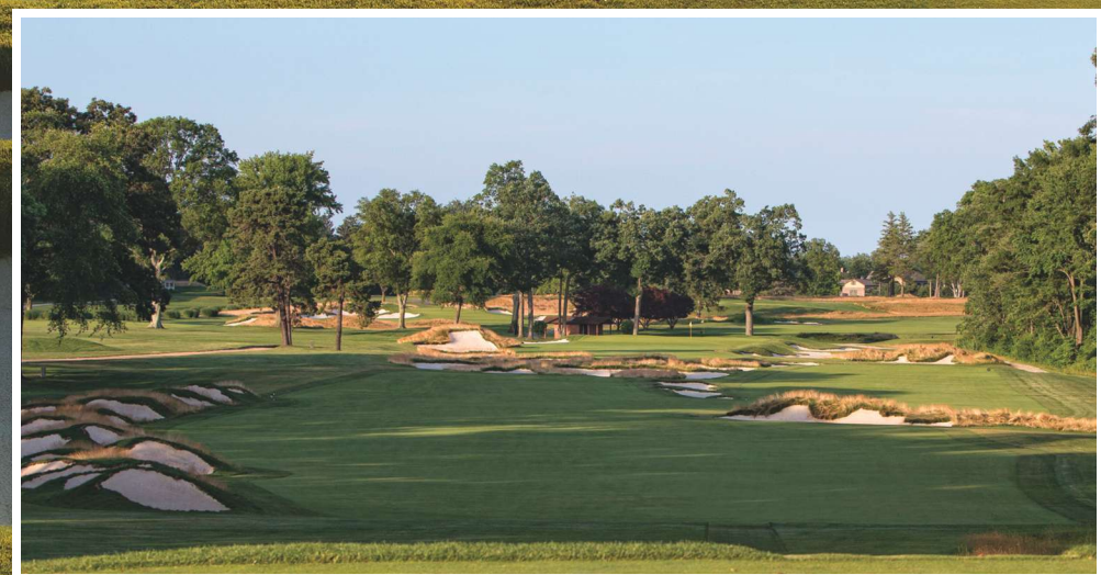
The 12th Hole of Hollywood Golf Club.