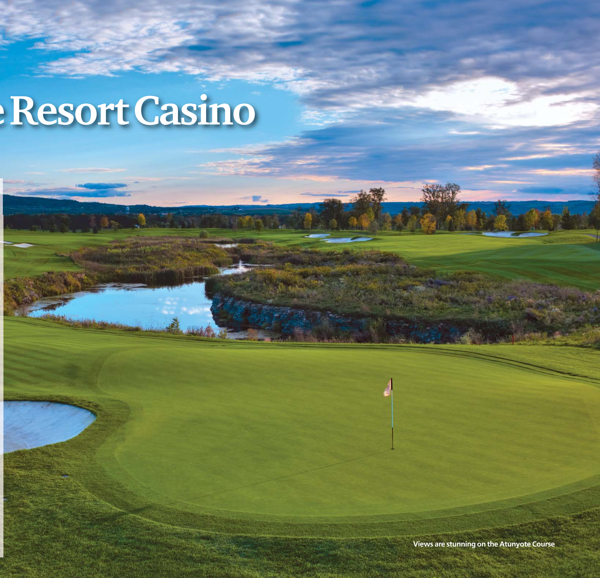
Views are stunning on the Atunyote Course

Salmon River. Located about 50 miles from Turning Stone, Salmon River boasts some of the best sport fishing in the country, especially in late September/early October.