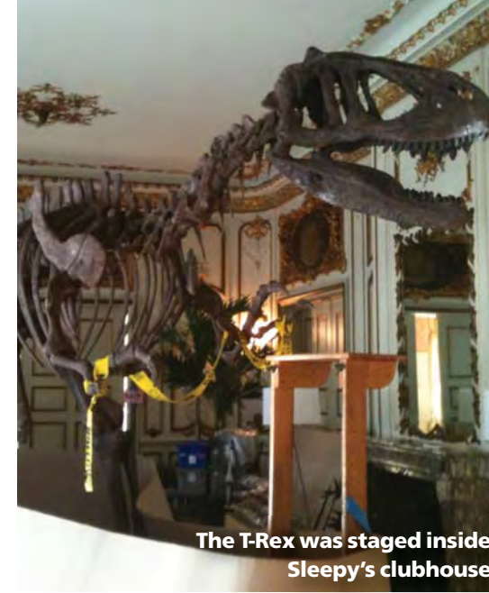
The T-Rex was staged inside Sleepy's clubhouse

Sleepy has also been the filming location of other productions, including television shows "The Good Wife," "30 Rock," "Pan Am," and movies "The Departed" and "The Bounty Hunter."