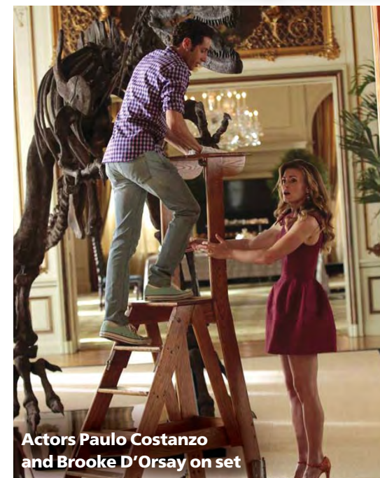
Actors Paulo Costanzo and Brooke D'Orsay on set