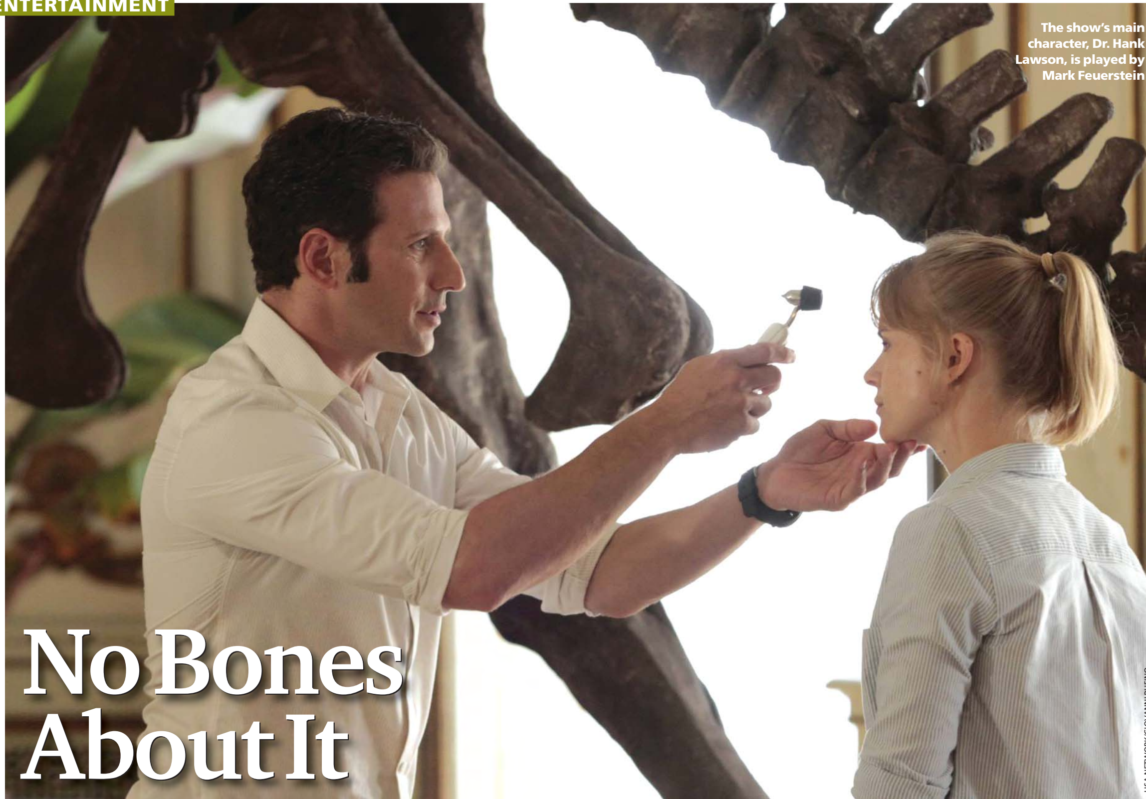
The show's main character, Dr. Hank Lawson, is played by Mark Feuerstein