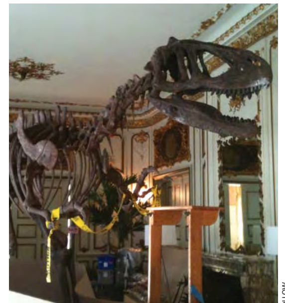
The T-Rex was staged inside Sleepy's clubhouse

Sleepy has also been the filming location of other productions, including television shows "The Good Wife," "30 Rock," "Pan Am," and movies "The Departed" and "The Bounty Hunter."