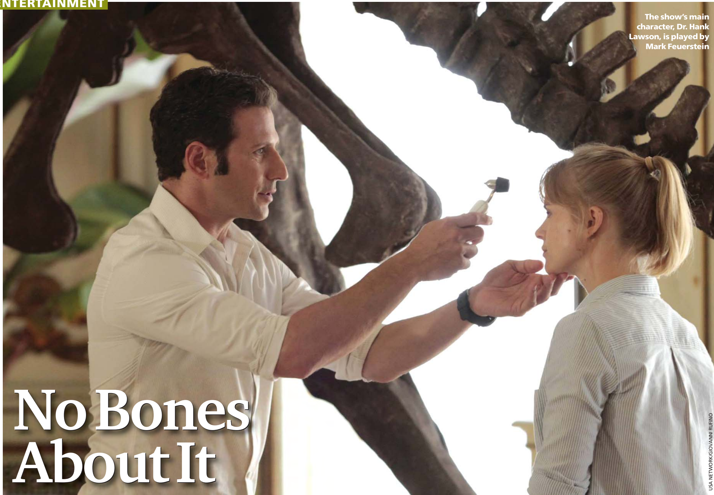
The show's main character, Dr. Hank Lawson, is played by Mark Feuerstein